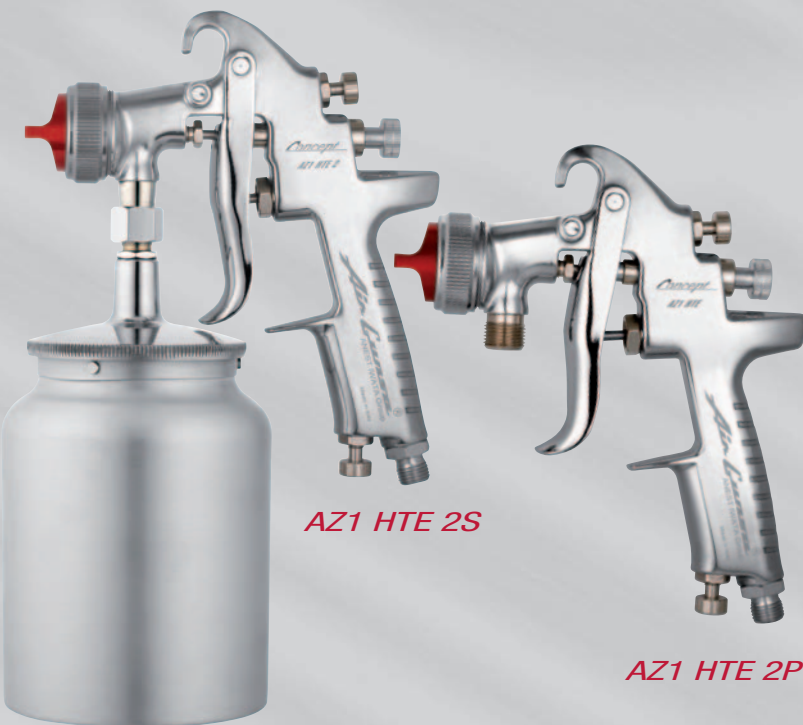
AZ1 HTE 2S