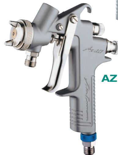
AZ 40 HTE SP

Max. Working Pressure: 7.0 bar (98 PSI) Noise Level (LAeqT) 75.6 dB (A) Temperature range: 5~40° C Air nipple: G 1/4" Fluid nipple: G 1/4"