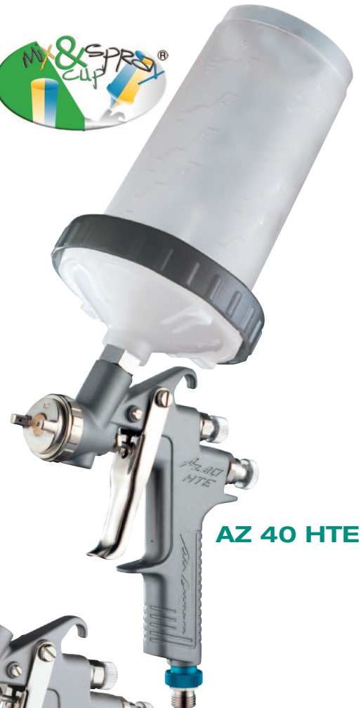
AZ 40 HTE