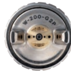
W-200 ROUND NOZZLE