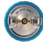
W-200 WB SPLIT NOZZLE